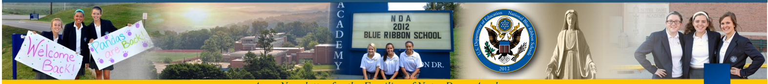
An e-Newsletter for the Families of Notre Dame Academy